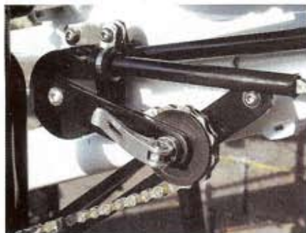
● This chain tensioner enables the front boom to be moved in or out to accommodate different sizes of stoker

The half-recumbent design looks to improve on the traditional form of tandem riding, where the stoker at the rear ends up looking at the back of the captain's head. With the stoker at the front and lower down, both riders have a great view. As their heads are closer together, it's a much more