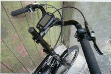
Above: Charge remaining is displayed on the highly informative STEPS console on the handlebar

The basic Helios design employs small wheels, a one-size frame, very long seatposts, and plenty of handlebar position adjustment, so